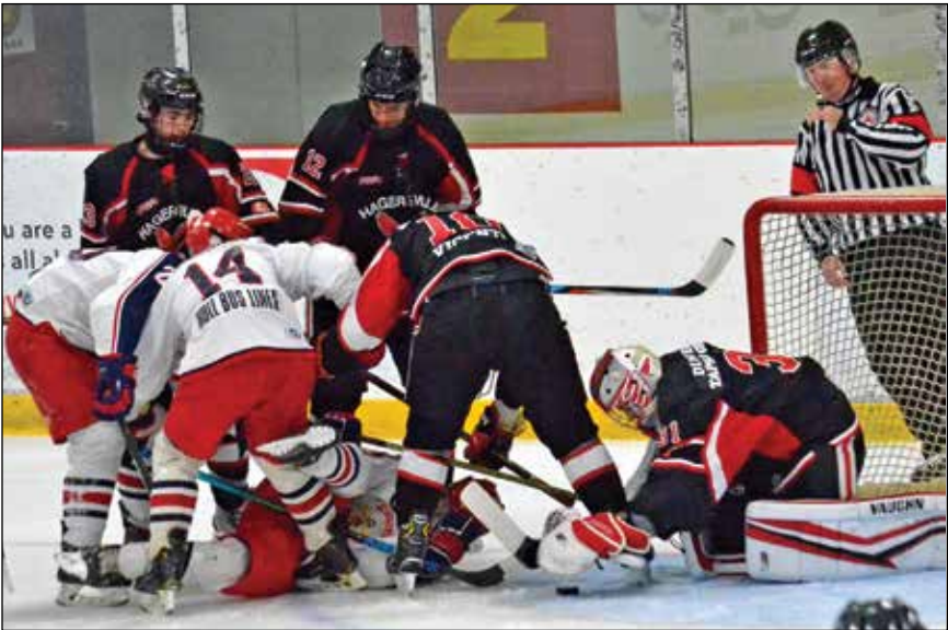
A scramble in front of the net during the Tier Two championship in Guelph Sunday.