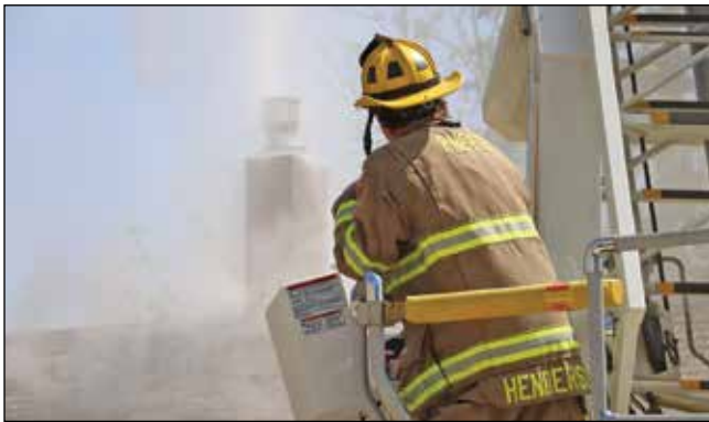
Firefighters use the ladder truck to reach the flames on the roof of the historic building.