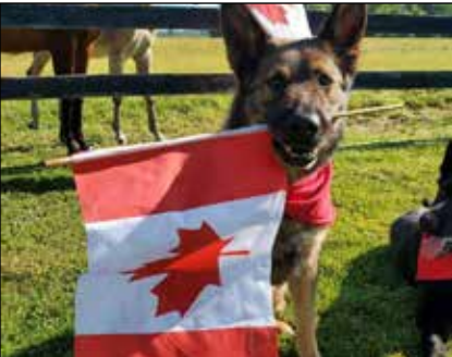
Blitz tracked down assault suspect

Watford man, had fled on foot. Police called in Blitz who in 30 minutes tracked down the suspect who had traveled two kilometers. Members of the ERT arrested the man. He's facing three assault charges and is in custody.