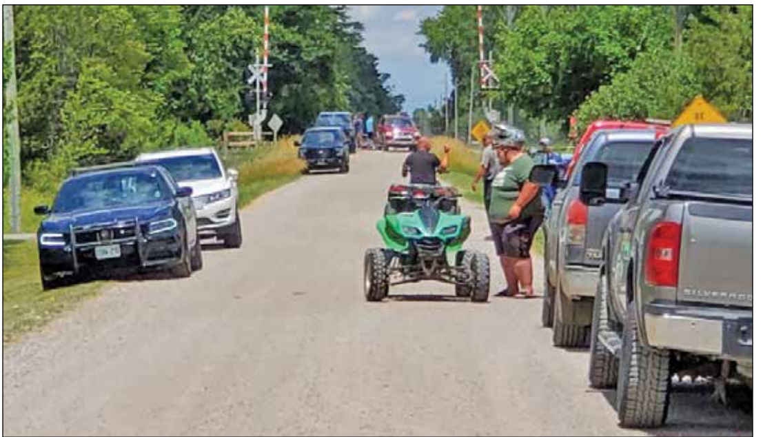
Neighbours flooded the roads around Zone Centre near Florence to stop an ATV thief Monday.

The rates will increase for the next council members on Nov. 15.