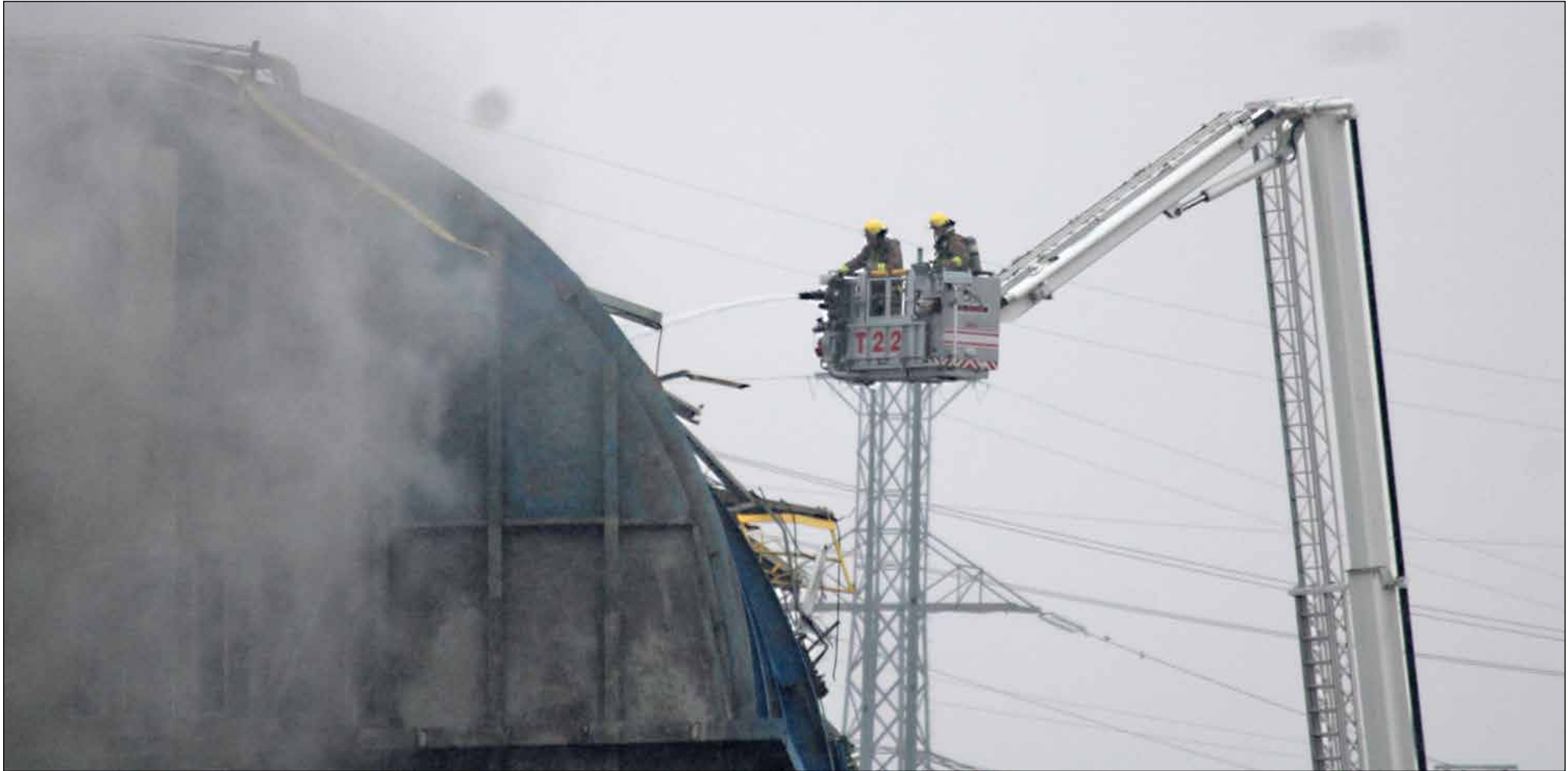
St. Clair firefighters were dwarfed by a tower at the former Lambton Generating Station Monday. Crews were called to the St. Clair Parkway site Monday for a fire. See more on page 2.